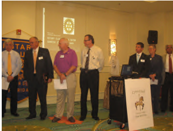
[Past Club Presidents Preparing to Speak]